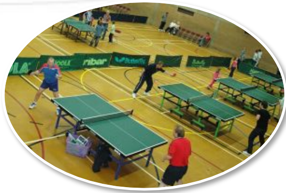
Table Tennis England also has a duty of care to participants in the sport to ensure that the coaching environment is safe. As part of that obligation, Table Tennis England Coach Licence Scheme provides a regulatory framework within which coaches must operate, built around the Code of Practice for Licensed Table Tennis Coaches

Attendance at a Table Tennis England approved CPD event will be a yearly requirement of the Coach Licence from 1st August 2014, therefore all coaches will be required to provide evidence of such attendance prior to that date. Internal CPD courses and training providers will be added to the website when they become available. It is essential that coaches seek to constantly develop their knowledge and education, as the coaching environment is constantly evolving and changing: new coaching methods, changing equipment and techniques, cultural changes in society, all coaches must keep up to date with these changes in order to be the most effective in supporting and growing players.