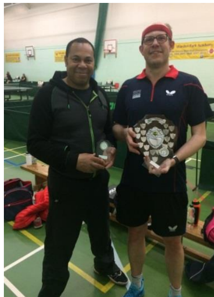
our winners from the closed tournament