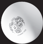
TABLE TENNIS LEAGUE