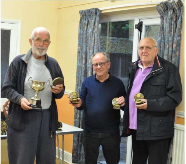
Kingfisher D, Div. 2 Champions, Season 2015-16