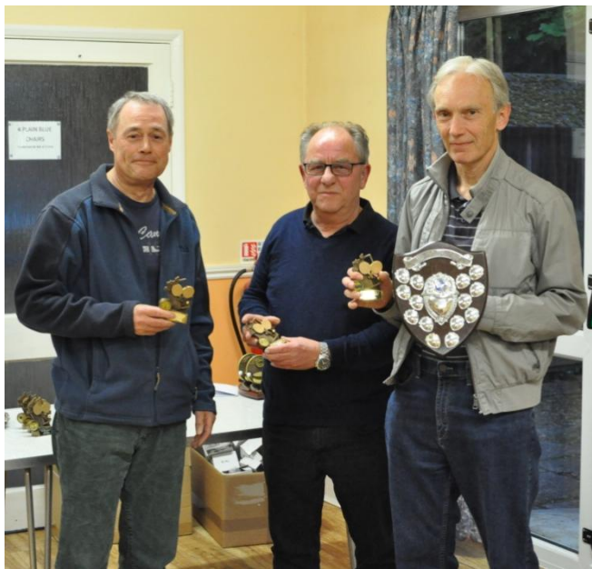
Kingfisher B, Premier Champions, Season 2015-16