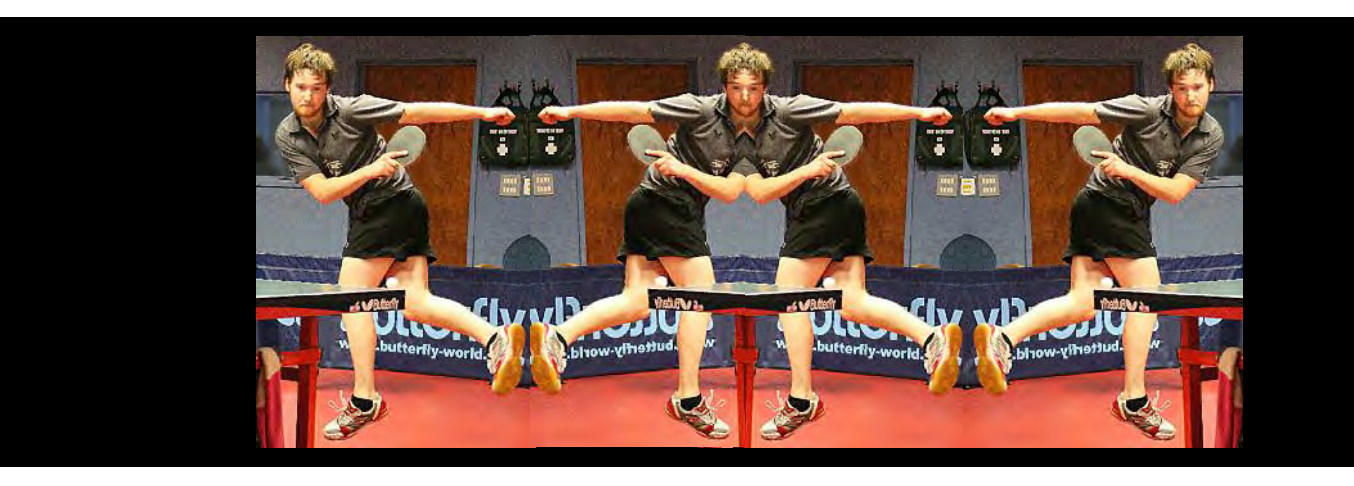
Reading & District Table Tennis Association Newsletter

Table Tennis England has ruled that all leagues will have to change to using plastic balls by the next season. However, dissatisfaction has been expressed with the durability of some of the types of ball that have appeared on the market so far. New types are continuing to appear, so there seems to be no urgency to make bulk purchases at this stage. Watch this space for more news!