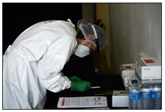
Covid-19 testing.

With Covid-19 still being a serious issue precautions were strict and regular testing undertaken to help ensure the safety of all players, officials and those involved.