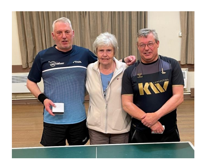
Played on Handicap Finals Night