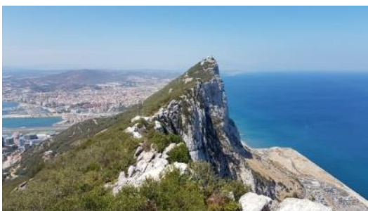
Top of the Rock

After an incredible team event performance the team were treated to a day off of sightseeing and free time. We went to the top of the rock and explored Gibraltar secrets with our local tour guide Matthew who we met along the way and who proved exceptionally knowledgeable.