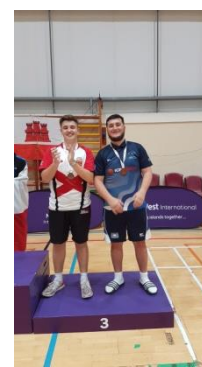
Our Isle of Wight Table Tennis Team Medal Winners