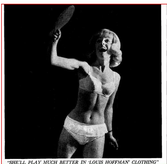
"SHE'LL PLAY MUCH BETTER IN 'LOUIS HOFFMAN' CLOTHING"

Not much good news there then, but there were always the politically incorrect adverts to enjoy.