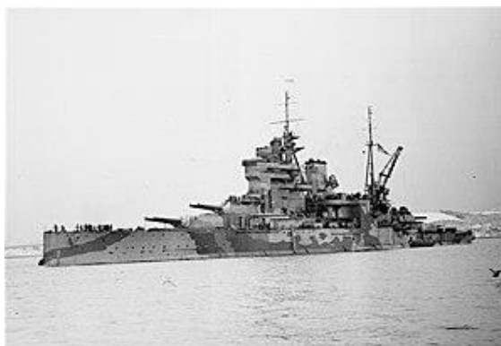
The only known fully-floating Affiliated Premises

The skeleton crew apparently all play table tennis, - and the Royal Navy's well-known reputation for hospitality is well maintained. No need to worry about the last bus home, either, in case of fog. With bunks for 1,000 they can put up not only the visiting team but the whole of a Final's Night audience as well!