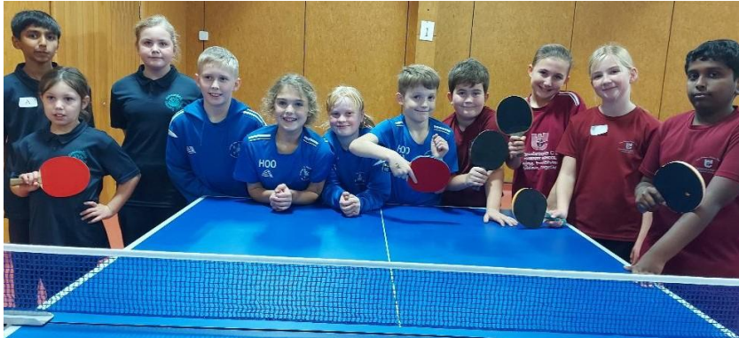
Summerfields, Newchurch and Carisbrooke teams

A very successful tournament was held at the IW Table Tennis Centre recently and the top three teams were Newchurch, Carisbrooke and Summerfields. All the children enjoyed the tournament and joined in with great enthusiasm and sportsmanship.