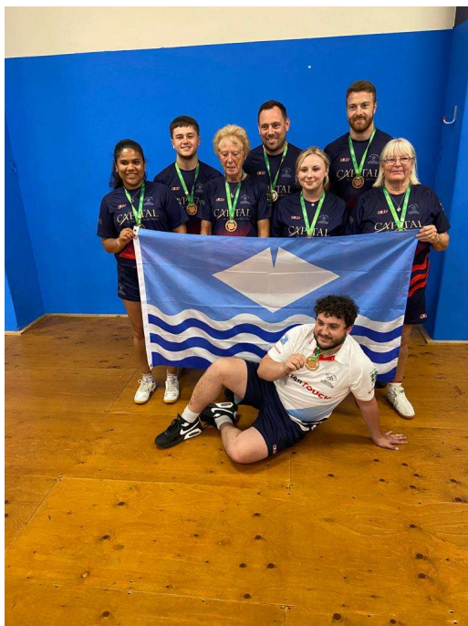
Flying the flag