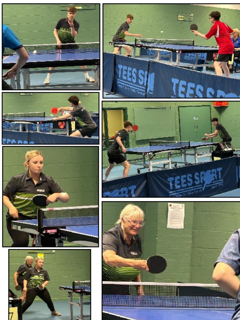
Isle of Wight players in action in the English Leagues' National Finals