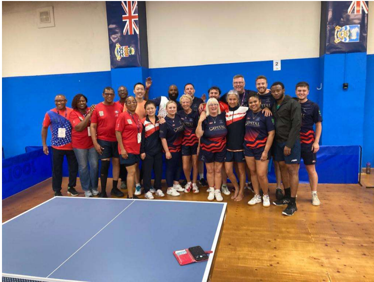
With the lovely Cayman Island team after their classic match for a medal