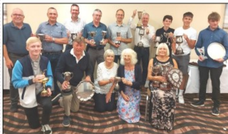
Photo of trophy winners from 2022 Presentation Evening