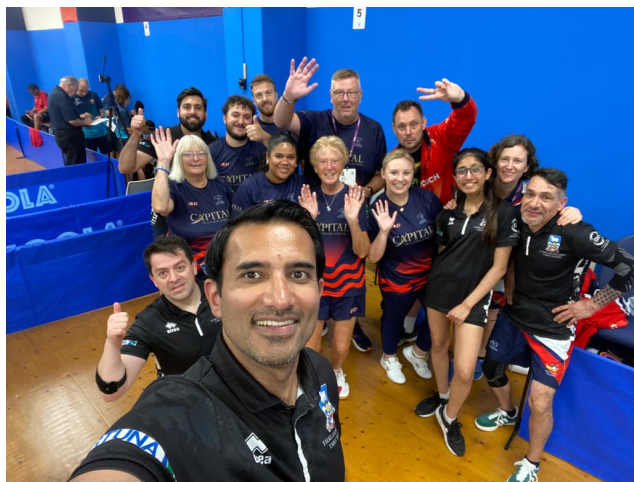
With the friendly Falkland Islands team

They are a great bunch of people and therefore a pleasure to play against but the weakest side in the group. A line up change for IOW saw us through to a 7-0 victory and on to the next game against Cayman Islands. Win and we had a minimum of bronze, lose and it was over!