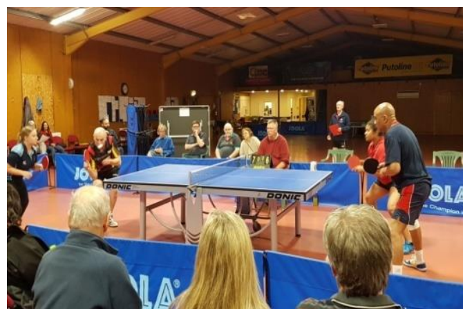
Mixed Doubles Action