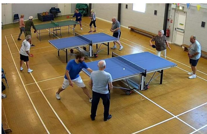
Participants at one of the new Wroxall sessions

Wroxall Table Tennis Club has started running regular twice weekly sessions at Stenbury Hall, Wroxall PO38 3DP. The sessions are Monday mornings between 10.30 am and 12.30 pm, and Wednesday evenings between 7pm and 9 pm. Bats and balls are provided and the cost is £3 per person to include tea/coffee and biscuits. Wroxall Community Association are thrilled to have started these new sessions and hope to build on the interest in the coming months, and look to progressing the club further in the future. Email: info@stenburyhall.co.uk