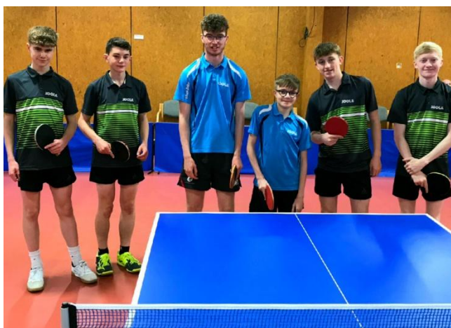
The Junior Team and opponents from Plymouth