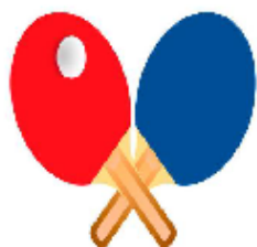
TABLE TENNIS CENTRE, SMALLBROOK

Junior Table Tennis Coaching is available at two Island venues:-