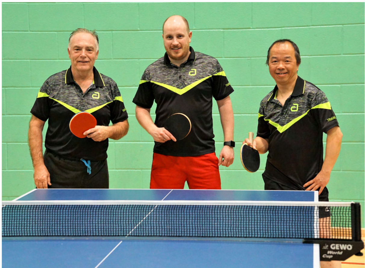
The triumphant Travellers A team pictured after claiming the 2021/22 Division 1 title